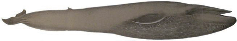
Plate 3 – Artwork by G.O. Sars: Blue whale ( Balaenoptera musculus ).