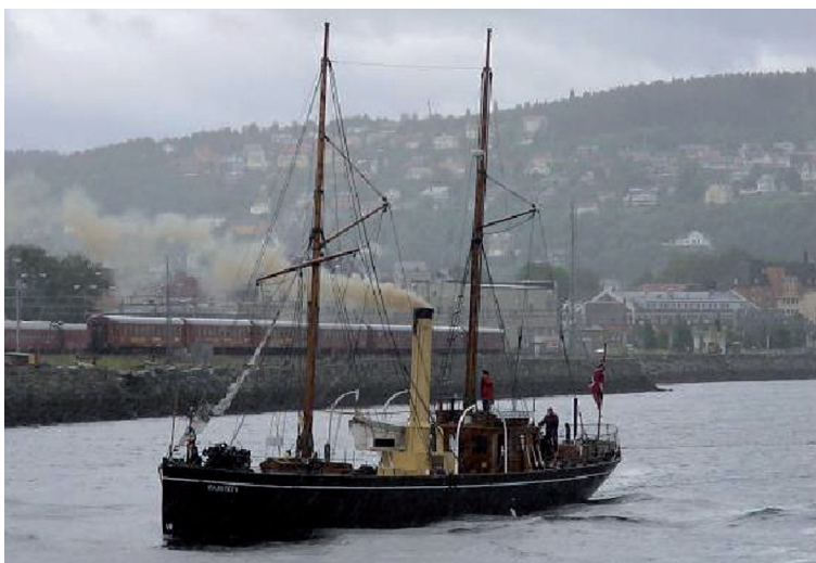
Plate 2 – R/V Hansteen in Trondheim harbour, the first vessel built for bathymetric and fisheries research, a veteran ship that is still sailing.

was later found and printed in 1881. His information on seals and whales is obviously taken from the works of Einar Gunnarson and Olaus Magnus, but a rather comprehensive section on commercial fish and shellfish probably originated from personal experience and contemporary common knowledge. His work served as a reference for scholars during the following centuries.