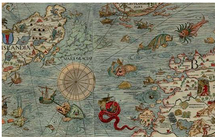
Plate 1 – Detail from Carta Marina published by Olaus Magnus in 1539, showing sea monsters in the Norwegian Sea, and the Moskenes tidal current in Lofoten, northern Norway.